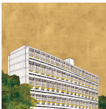
Roehampton Summer

For more information please visit www.lucydalzell.com and to download high-res images click HERE