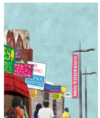
Peckham I Love You © Lucy Dalzell